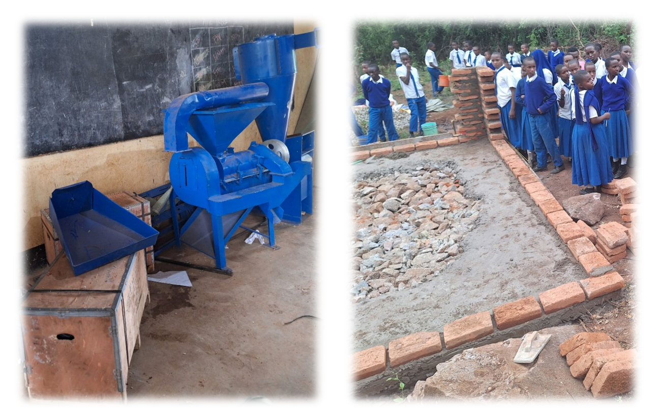
Crusher (1 still in box) and construction of the workshop for the crushers Endallah Secondary School

Endallah Secondary School : Purchase and connection of two 'grinding machines' and construction of a workshop for these machines. Currently, the maize used to prepare the meals of the 500 students is transported to the village to be ground into maize powder – for a fee. In addition to being time-consuming, this is also expensive. Through the purchase of two crushers, the maize will now be ground on the school site itself. The operational costs (electricity and repairs) will be covered by making the grinding machine available to local residents for a fee. Project cost: 12,760,000 TZS